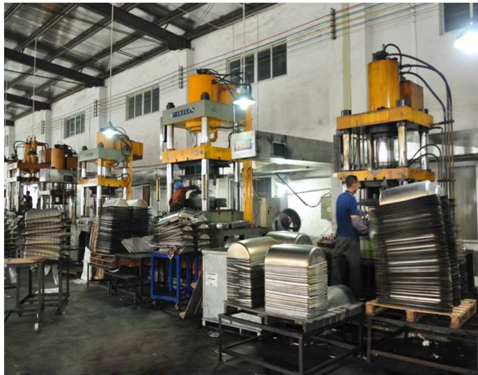
Hydraulic Pressing Machine 1