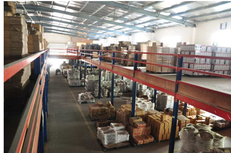
Finished Product Warehouse

For more products or message please visit www.whkitchenware.com or email to ben@whkitchenware.com