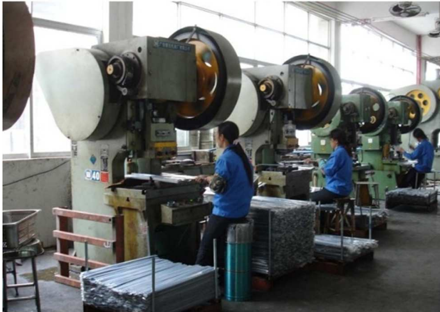
Bending & Cutting Machine