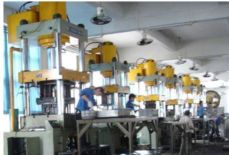
Hydraulic Pressing Machine 2

For more products or message please visit www.whkitchenware.com or email to ben@whkitchenware.com